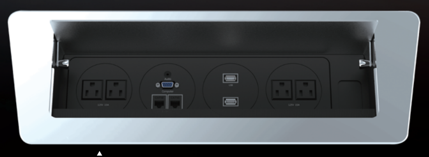
or options of power socket for different countries

Features and specifications are subject to change without notice.